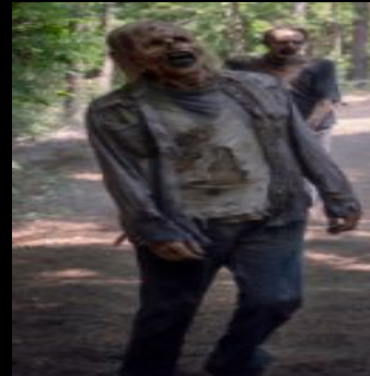
HARD TIME WALKING STRAIGHT