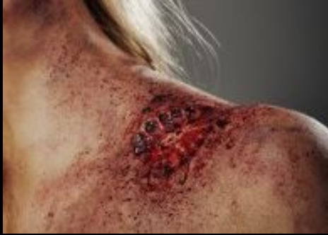
ZOMBIE BITE MARKS