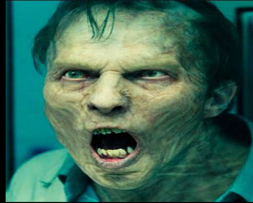
LOW BLOOD CIRCULATION